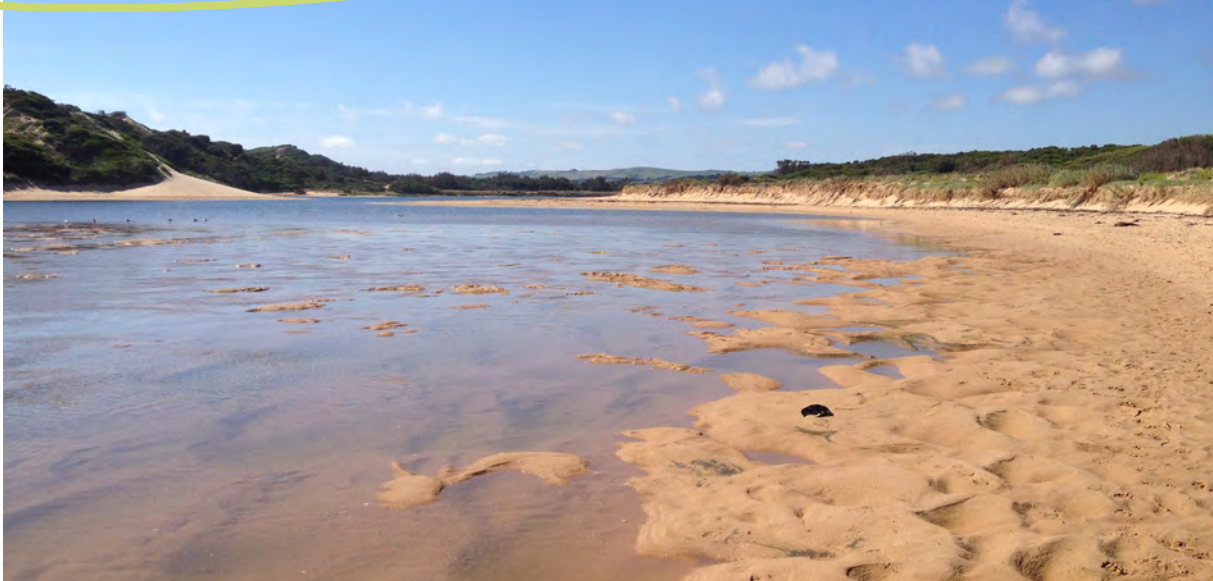
Looking north from Powlett River Estuary Mouth.