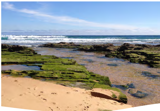
Left: Saltmarsh downstream of the Mouth of Powlett Road Bridge. Right: Mouth of the Powlett River estuary.