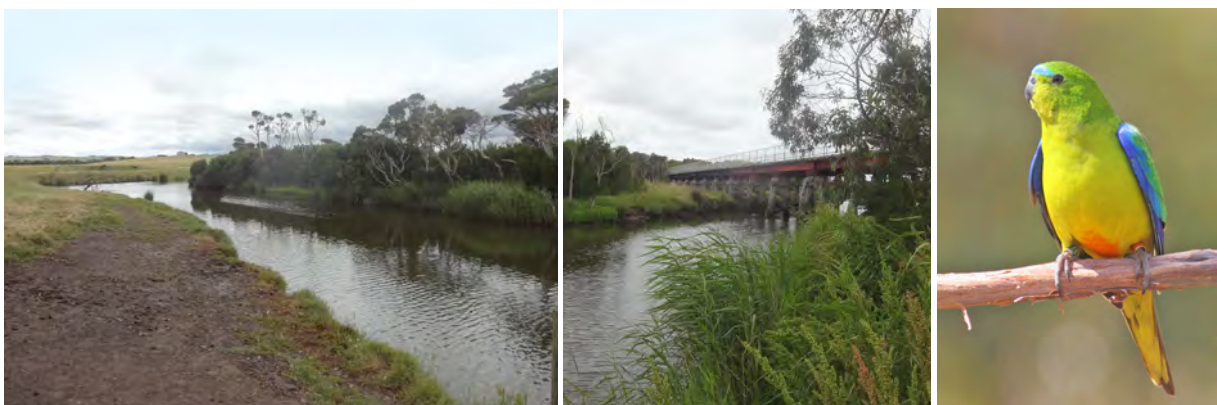
Left and centre: Swamp Scrub vegetation north of Daly Bridge. Right: Orange-bellied Parrot.

To assist the West Gippsland CMA and other stakeholders to allocate funding to the actions and to seek appropriate external funding, the actions have been prioritised. Implementation of the actions is contingent on the availability of funding.